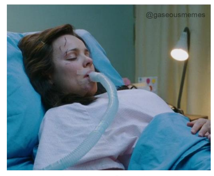
Hollywood producer: Should we get a medical opinion for this scene?

The newsletter for anaesthetic trainees in EoE